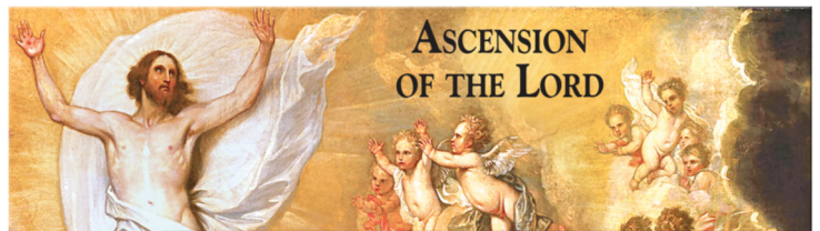
ASCENSION OF THE LORD

Thursday, May 25th - The Ascension of the Lord