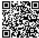
Haiti - Sister Parish Donation www.stjoanhershey.org

Our Sister Parish in Haiti needs your help. Ash Wed, on February 18, offers a great opportunity to make a difference, since 100% of the collection will benefit our Sister Parish in Haiti. Donations can also be made at the parish office or online by scanning this QR code with your phone.